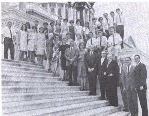
Student Ambassadors meet with Legislators on steps of nation's Capitol.

PREPARATION If you are selected, you will meet with a teacher-leader for instruction and orientation starting during the second school term. (There will be a teacher-leader for each group of approximately 15 students. Appointment will depend upon their ability to lead, organize, instruct and chaperone.) With your group, you will have discussions about the areas to be visited; be given a list of required and suggested reading material; be briefed by guest speakers and receive complete orientation.