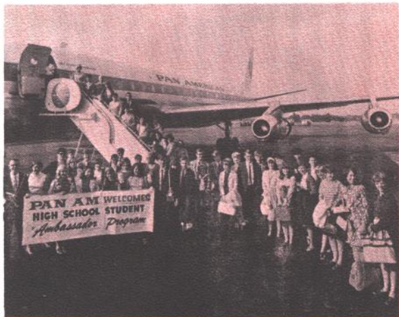
Student Ambassadors depart Washington, D.C. for Europe

THE SUMMER OF 1970 will be the eighth year that organized groups of high school students will travel through Europe as People-to-People Ambassadors.